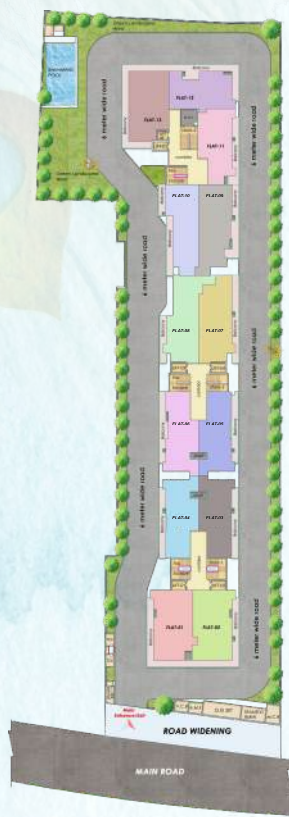
KEY UNIT PLAN