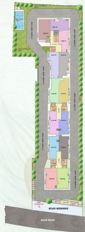
KEY UNIT PLAN

Note:- Visual representations shown in this folder are purely conceptual designs and are not legal offerings. These are reference images just to show/present the layout of the project Elevations, Site plan, Unit plans and specifications etc are tentative and subject to variation and modification by the company or competent authorities without prior notice.