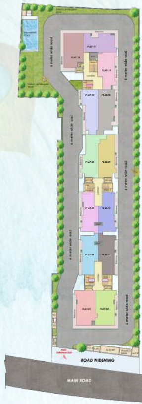
KEY UNIT PLAN